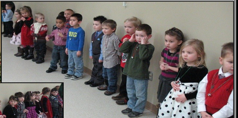
Early Years School House